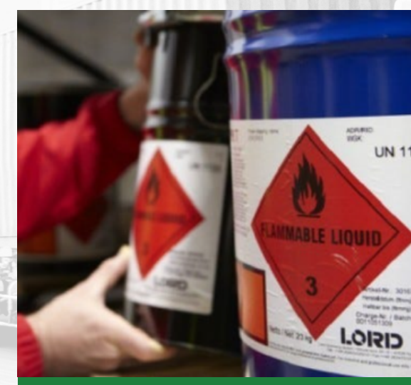
Dangerous Goods Handling